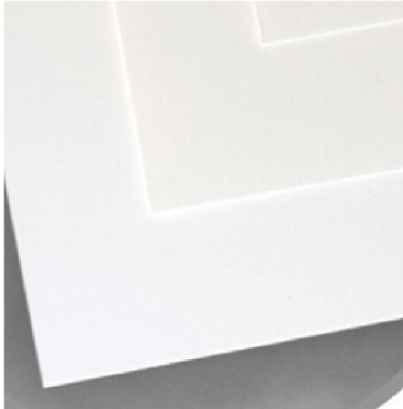
STANDARD SMOOTH 115LB WHITE

All invitations are by default printed digitally on standard white 115LB card-stock; however you can opt for a thicker 130LB linen texture card-stock in white or ivory to give your item a more luxurious look