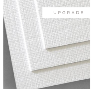
WOVEN LINEN 130LB WHITE